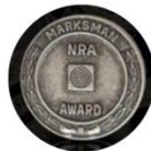
NRA Marksmanship Qualification